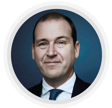
Lodewijk Asscher Special Adviser for Ukraine