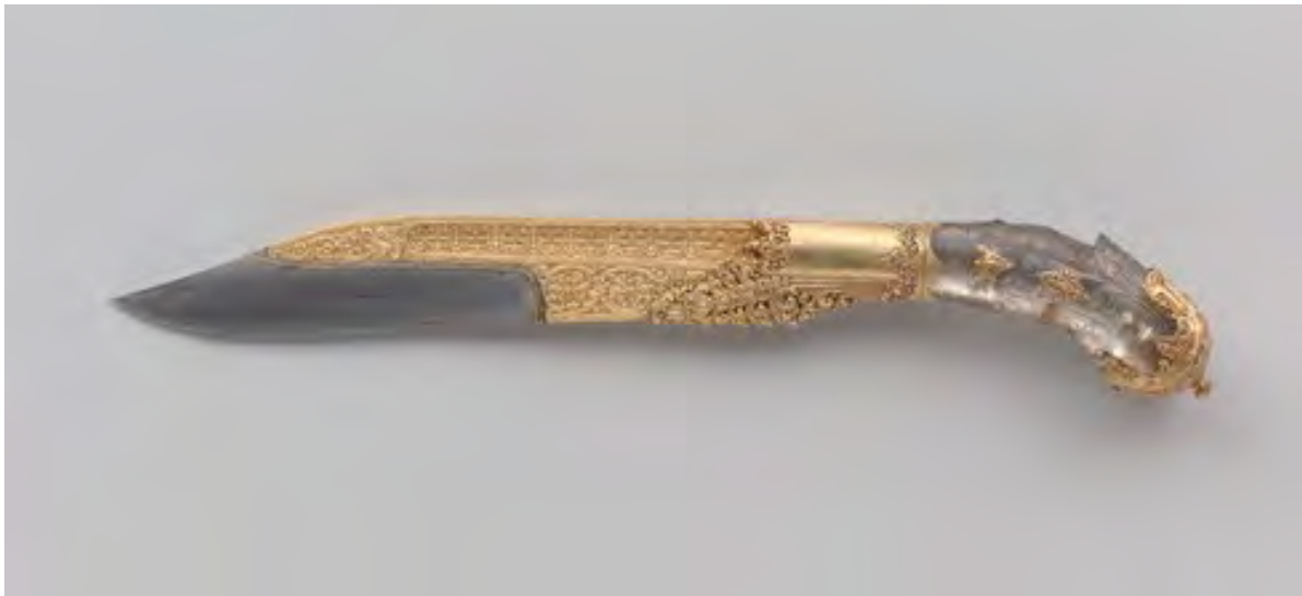
Photo 1: Kandyan knife. (Rijksmuseum, Amsterdam, inv.no. NG-NM-7114).

The pihiya , recorded as NG-NM-7114, has an engraved crystal hilt set with gold. Two-thirds of the blade is covered with elegantly worked gold. The wooden sheath is embossed with a golden plate, the edges are decorated with filigree, ending in a curl in the bottom. 1 The length of the knife is 29,5 cm. The Colombo National Museum has assessed 75 similar types of knives in their museum collection, and shows that NG-NM-7114 stands out by its crystal handle, the usage of gold and its decoration. 2 This is also the case for the four Kandyan knives that are at present in the collection of the Royal Asian Art Society in The Netherlands (on loan in the Rijksmuseum), as well as in the collection of the Dutch National Museum of World Cultures: these are all of a coarser type than NG-NM-7114, both with regard to the craftsmanship and material used. 3