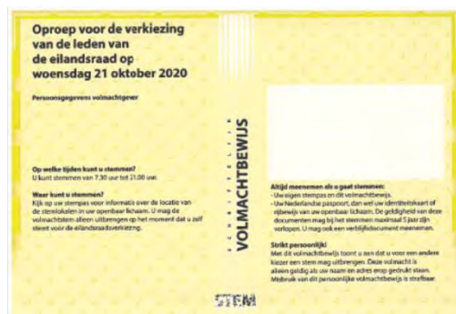
Written voter proxy sample

The ACE Electoral Knowledge Network indicates that proxy voting is permitted under the law in very few jurisdictions globally (both the Netherlands and the United Kingdom offer the option), noting that “a proxy vote may be given where a voter is unable to attend a voting station through infirmity, employment requirements, or being absent from the area on