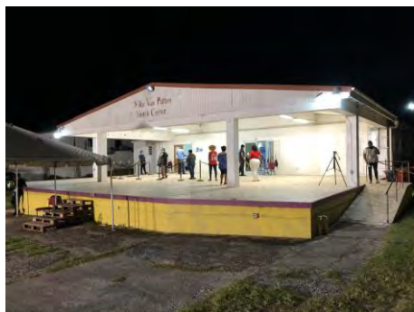
Lion's Den Polling Station

Voting progressed smoothly throughout the day with voters casting their ballots in secret and with no visible signs of intimidation. Approximately six electors had difficulty communicating with the polling officials, in part due to the ballots only being available in Dutch. Voting bureaux closed on time at 9:00 pm, as there were no electors in line at closing time. In addition, approximately ten electors were turned away due to a lack of or improper identification. 63