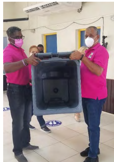
Voting bureau members display empty ballot box before polling

The voting locations were laid out to facilitate adherence to COVID-19 protocols. 62 The staff of the voting bureau sat behind plexiglass dividers which separated them from voters, while they themselves sat six feet apart from each other. There were markers on the ground indicating where voters were to stand to ensure they remained two meters apart. The hands of voters were sanitized three times during the process: at the entrance, after interacting with the chairperson of the voting bureau before voting and upon leaving the polling station. Voters used separate doors to enter and exit the locations to ensure they did not have to come in close contact with each other. The voting booths and the pencils were sanitized immediately after each voter exited the voting booth. The vast majority of voters adhered to the COVID-19 protocols by observing social distancing, sanitizing their hands and wearing masks. They also