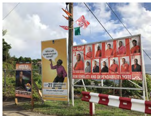
Political party and voter advertising

In normal times, the principal/central electoral committee is composed of five members, including a presiding officer, a deputy presiding officer and three deputy members. The Island Governor acts as presiding officer, and other members are appointed by the Island Executive Council. While there are clear eligibility requirements in the law, the appointment and dismissal process are not further elaborated, and it is conceivable in such a small community that these appointments would be called into question as not being impartial. Presumably, this electoral committee will be