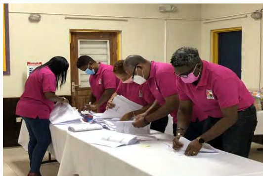
Polling officials count ballots in Lion's Den at close of polls while voters, candidates, and journalists watch

Directly following counting, the sealed results packets and results form ( proces-verbaal N 10-1 ) were handed over to the police for safe keeping. Final results were publicly declared two days later, by which time the IFES Team had departed the island, at a meeting of the Central Voting Bureau. The final results showed a total of 1616 votes cast (1586 valid votes, 14 blank votes, 16 invalid votes), with 815 votes for the PLP, 647 DP and 124 for UPC. At the time no explanation was given for the difference of one vote cast. 81 Interestingly, the DP received more votes at the Lion's Den and the PLP received more votes at the Sports Center. Based on the final results, the seat allocation remained the same as announced at the time of the preliminary results announcement.