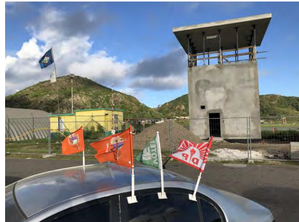
Campaign flags on a voter's vehicle

The voter education campaign was disseminated through printed fliers, posters and billboards. There were also advertisements placed on local radio stations. There is no functioning local TV on Sint Eustatius. In addition, ordinances were issued clearly outlining voting roles and responsibilities and COVID-19 safety protocols. Social media and the government website were widely used by the Government of Sint Eustatius to disseminate updates on the election as well as COVID-19. Voter education was in both Dutch and English, but not Papiamentu or Spanish. 86 The general consensus from all interlocutors was that the information provided was both relevant and timely.