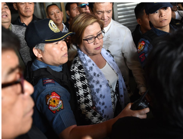
Philippine Senator Leila de Lima is escorted by police after her arrest at the Senate in Manila on 24 February 2017

Decision adopted unanimously by the IPU Governing Council at its 206 th session (Extraordinary virtual session, 3 November 2020)