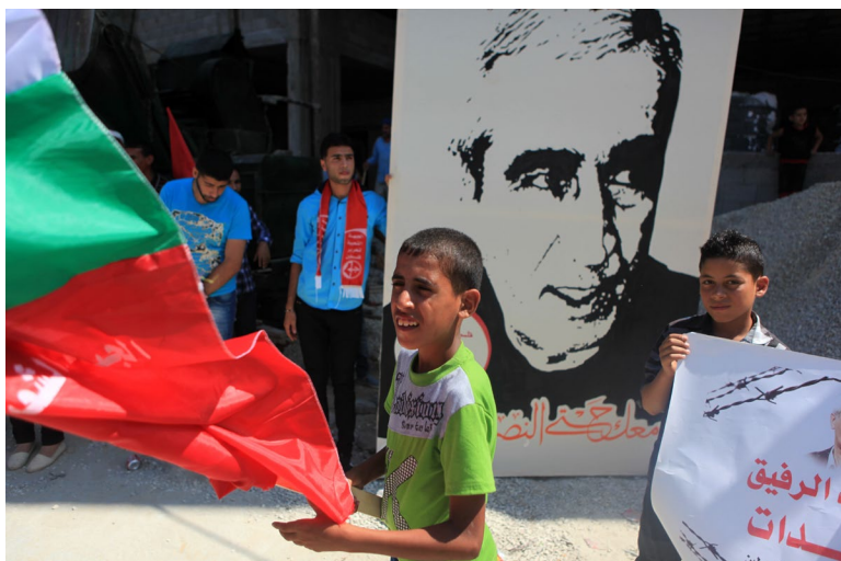
Palestinian supporters of the Popular Front for the Liberation of Palestine (PFLP) take part in a protest outside the UNDP office calling for the release of Ahmad Sa'adat, leader PFLP, in Gaza city on 29 July 2015.

Decision adopted by consensus by the IPU Governing Council at its 206 th session (Extraordinary virtual session, 3 November 2020) 5