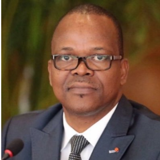
Alain Lobognon, Twitter

Decision adopted unanimously by the IPU Governing Council at its 206 th session (Extraordinary virtual session, 3 November 2020)