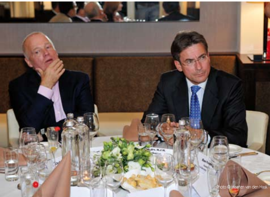
Minister of Foreign Affairs Maxime Verhagen (r) and Free Voice director Bart Dijkstra (l).

The Dutch government strongly defends freedom of expression - including press freedom and freedom of access to information - as a fundamental human right. It is also central to the protection of other human rights. Because freedom of expression allows people to demand other human rights, such as justice, equality before the law and freedom of religion or belief. Without freedom of expression, these other freedoms cannot be properly exercised. Moreover, freedom of expression makes electoral democracy meaningful, builds public trust in government, and strengthens mechanisms for holding governments accountable.