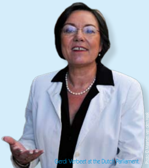
Gerdi Verbeet at the Dutch Parliament.