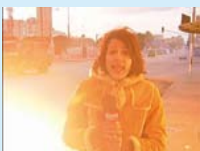
Stills from footage shot by Faten Elwan and her crew